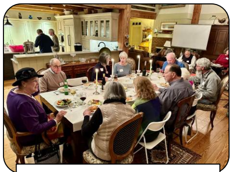
Fireside Chat Mealtime